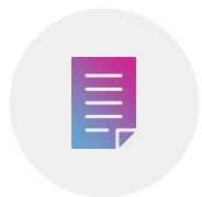
PRODUCT DEVELOPMENT TEMPLATE