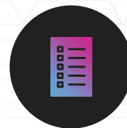
LEARNING SERVICES UNIFIED TEMPLATE